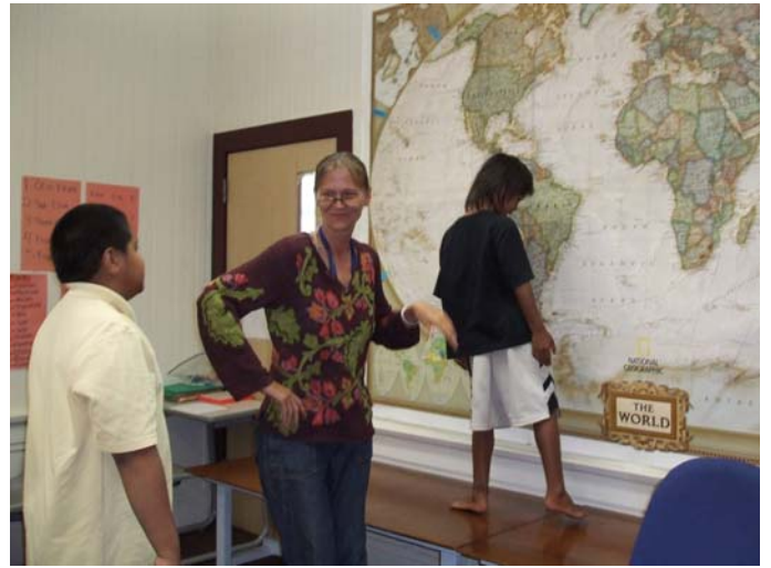
Learning for a Lifetime Classroom at Palama Settlement