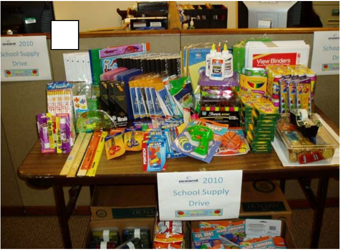
Collection Table at Oceanit